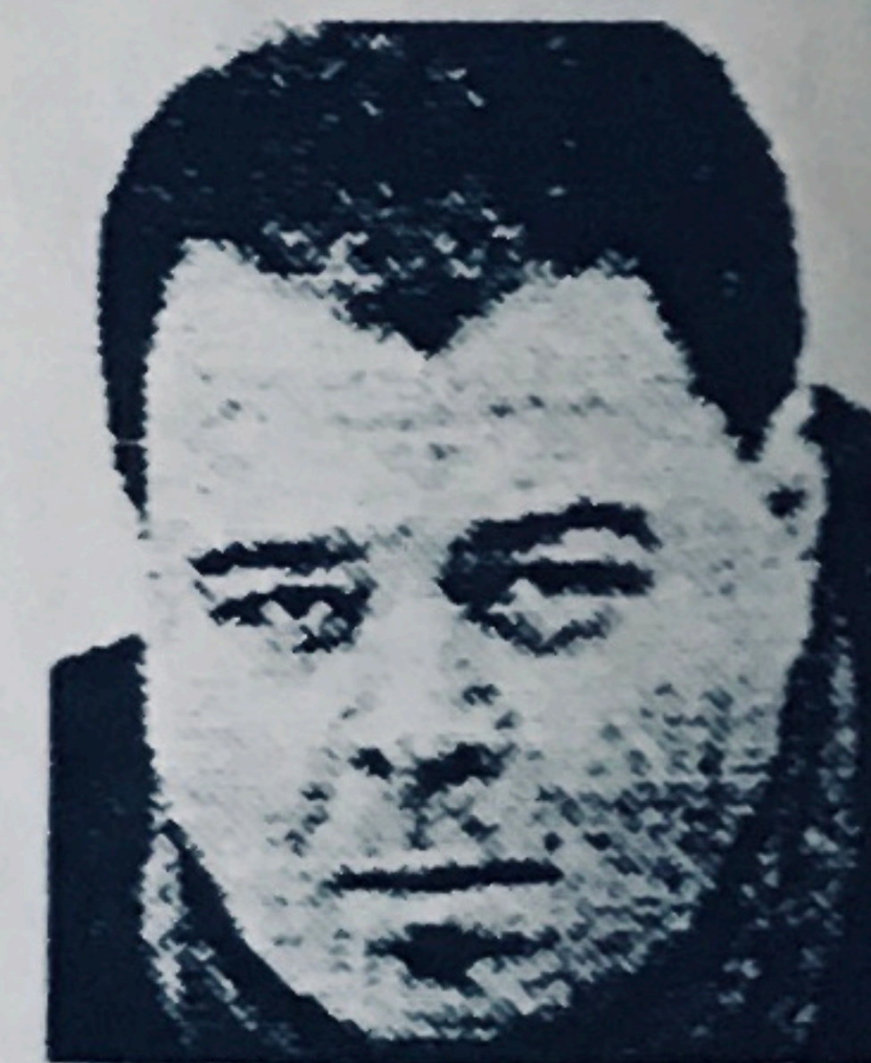
COPY: Pere Ubu