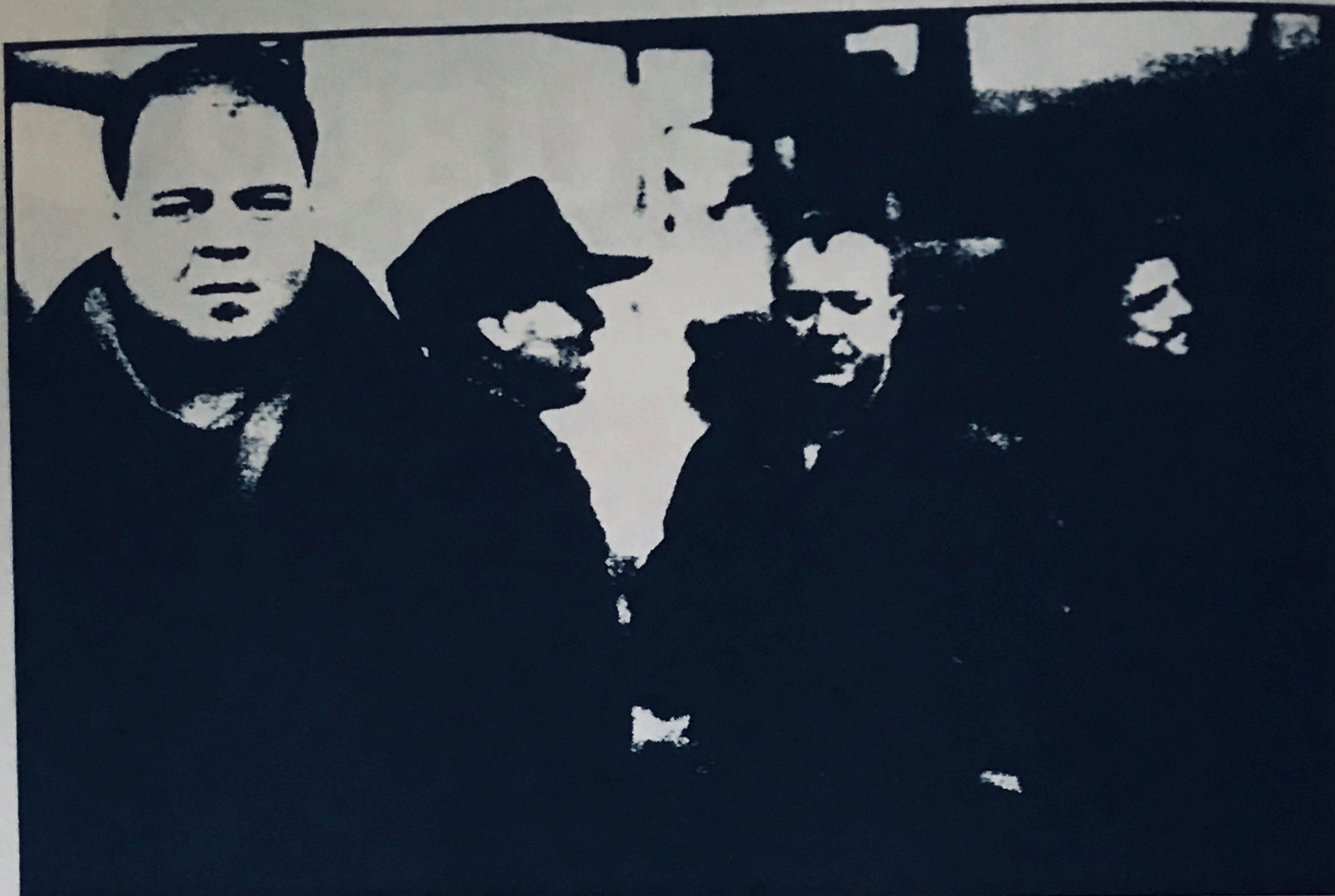
PERE UBU: easily confused with George Michael